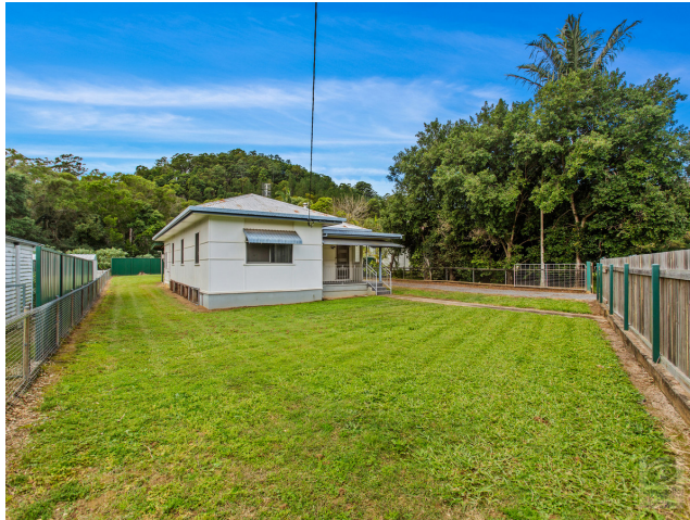
6090 Tweed Valley Way